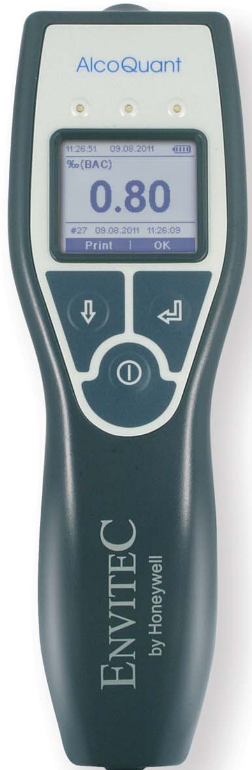
Device in original size