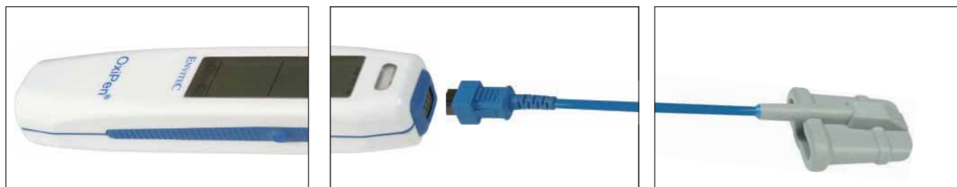
OxiPen®, relating connection and SoftTip® large

The proven performance combined with simple operation makes OxiPen® your reliable guide in "patient to patient" SpO 2 monitoring.